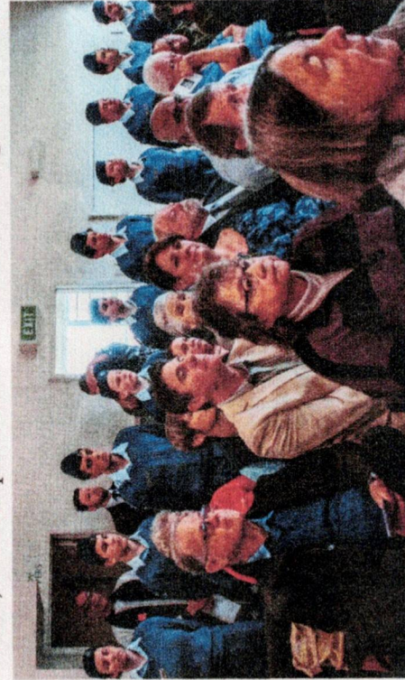
The Thames Air Cadets flank the room for the ceremony.