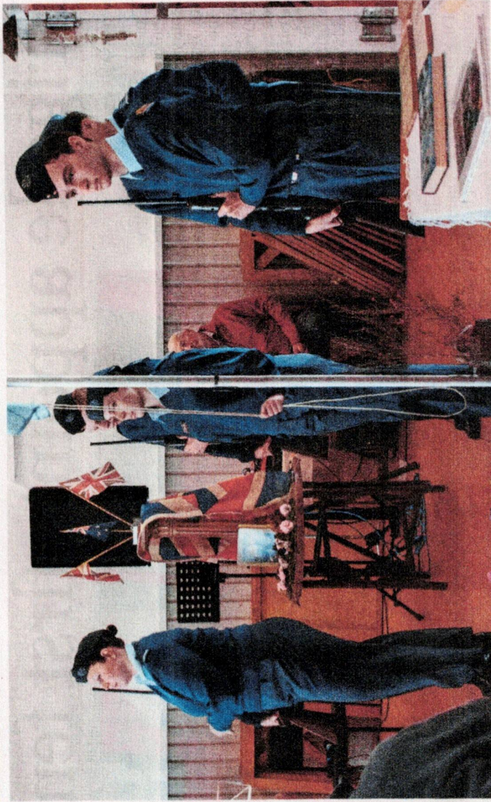
Cadets stand to attention as the retreat is sounded.