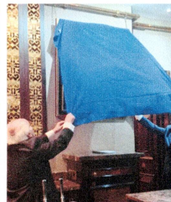
Lord Dowding Unveiling grandfather