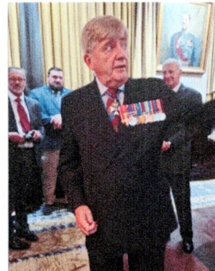
President RAF Club